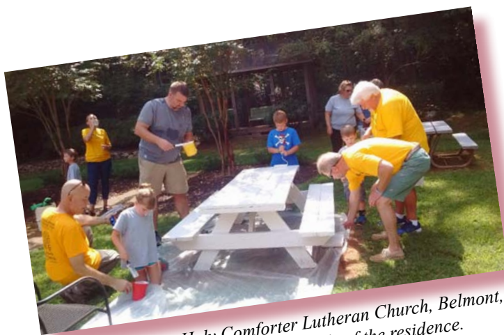
Volunteers from Holy Comforter Lutheran Church, Belmont, NC, paint a picnic table outside of the residence.