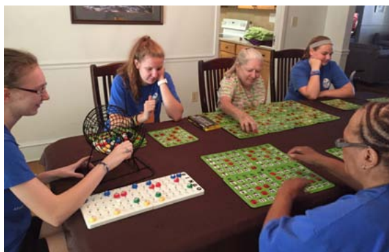
Thanks to the students from Mother of Mercy High School in Cincinnati, OH who came for a week to work and played bingo daily with our residents.